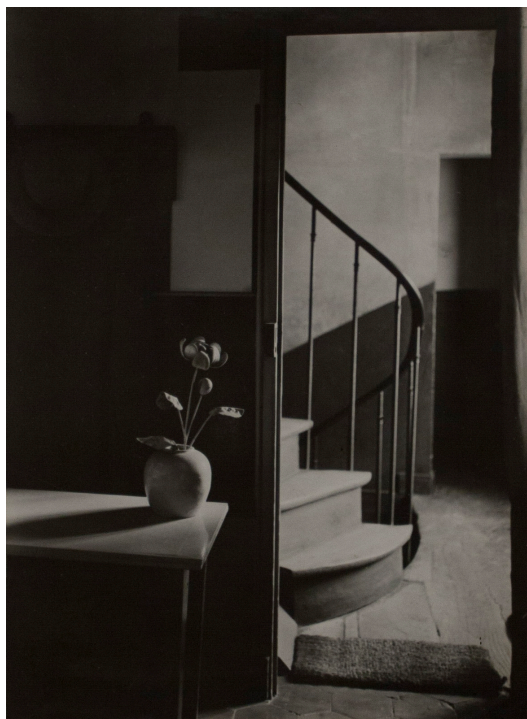
André Kertész (1894-1985) Chez Mondrian Gelatin silver print tipped to period vellum, printed c. 1926

The Visual Language of Modernity: The Early Photographs of André Kertész opens Thursday, May 25th, with a reception from 6 – 8 pm. For more information, please contact inquiries@bruceilverstein.com or go to www.bruceilverstein.com .