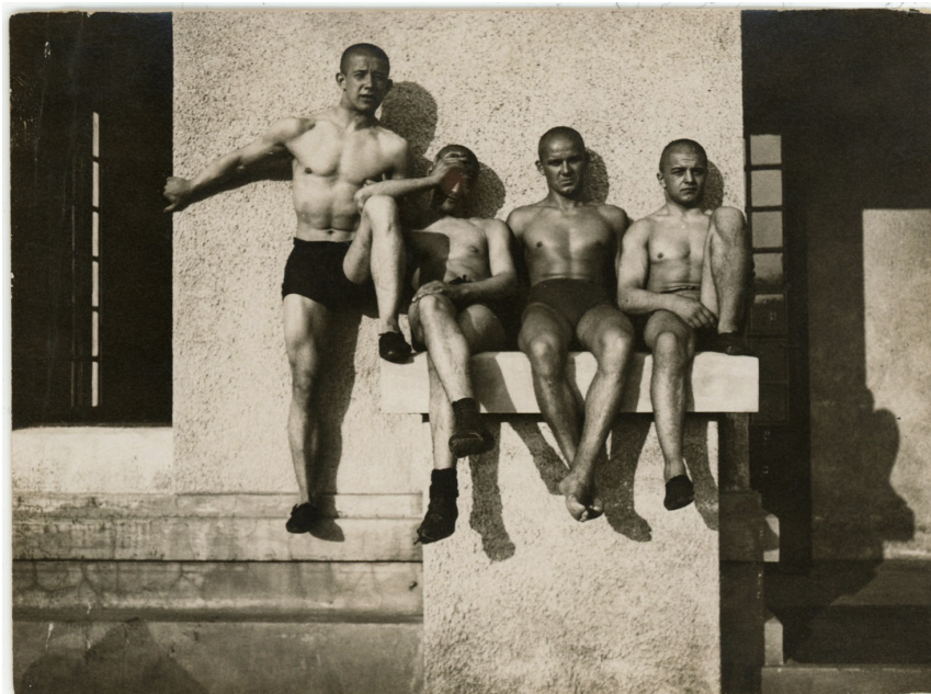
Group of four men in trunks sitting on a ramp, Gelatin silver print, printed c. 1914