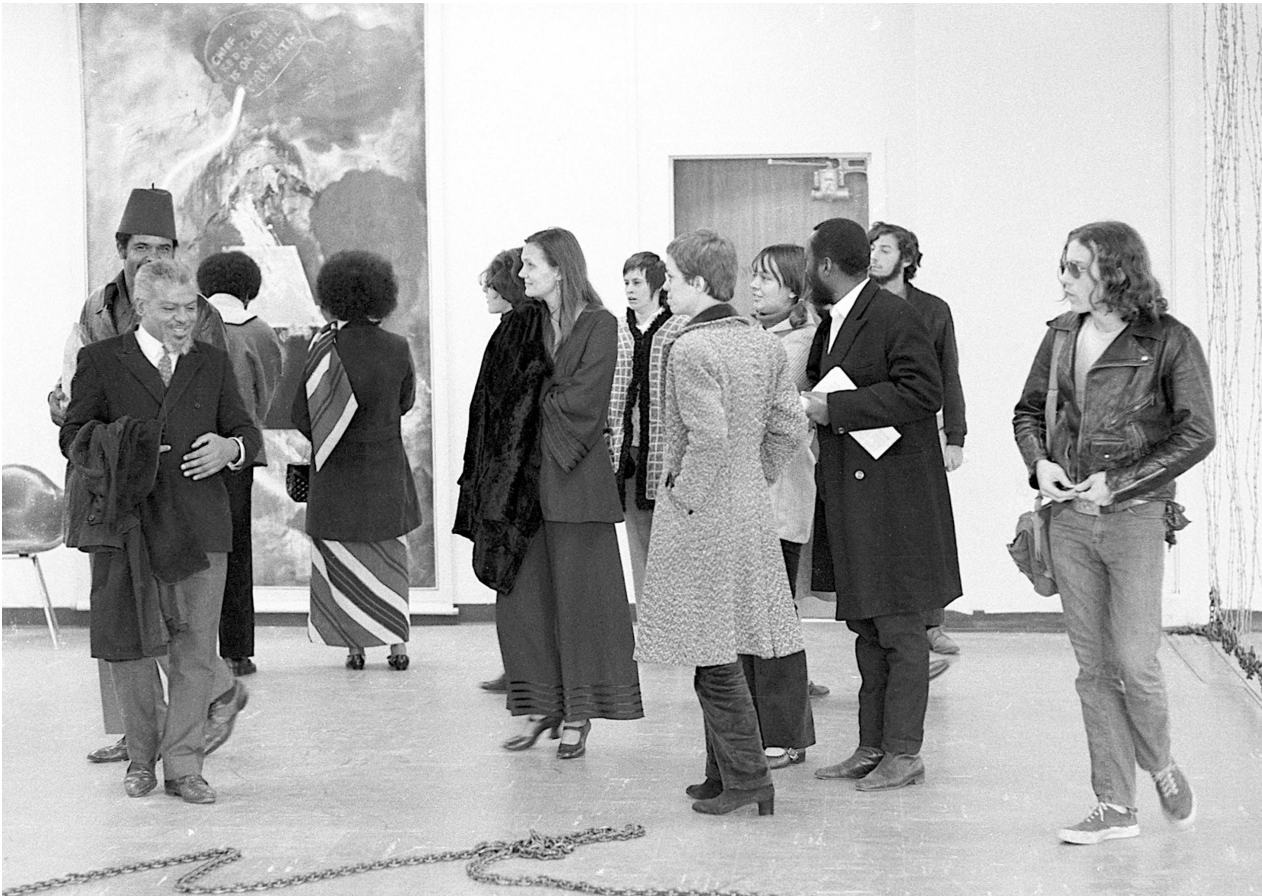
5+1 exhibition opening, 1969.